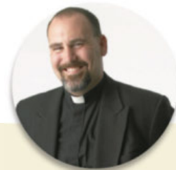
FATHER JOE KRUPP is a former comedy writer who is now a Catholic priest. 🐦 @Joeinblack

From: Together Let Us Go Forth • December 2021/January 2022 The Magazine of the Diocese of Phoenix