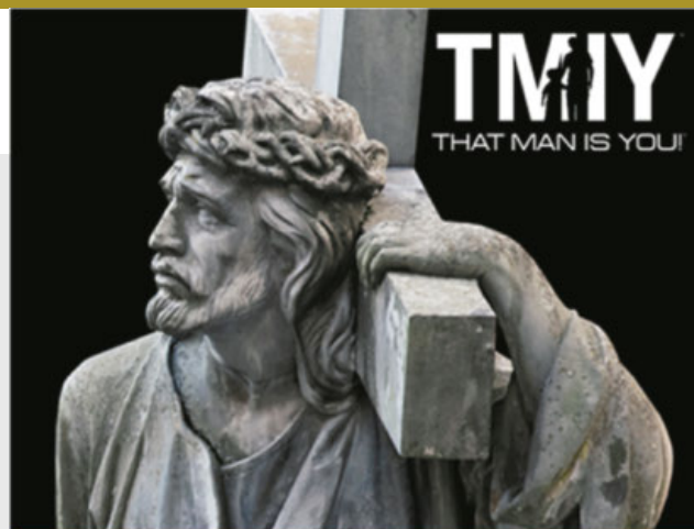
TMIY: Thy Kingdom Come - Starts this Week!

That Man Is You! is starting this Friday, January 21st at 6:30 am in the Ministry Building. The Spring program is continuing entitled: Thy Kingdom Come , and features ten dynamic Catholic speakers. Start your day off in fellowship and join other men of St. Gabriel and learn how to claim your royal dignity and inheritance.