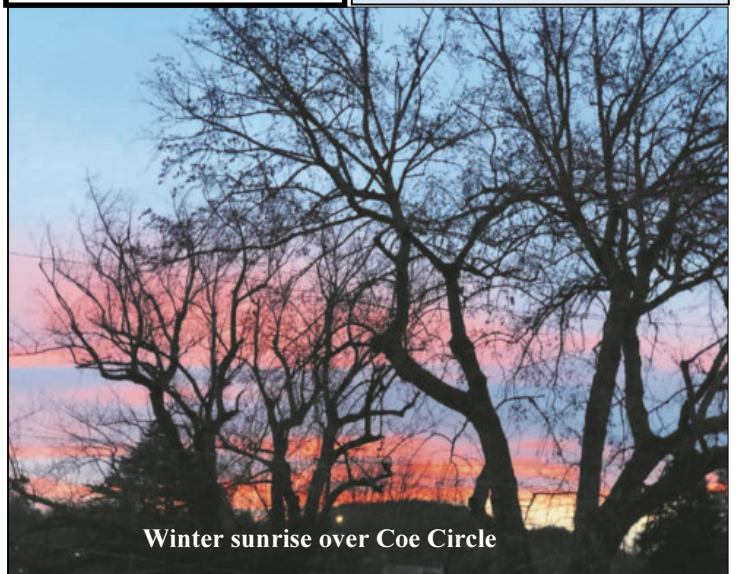
Winter sunrise over Coe Circle

Moving (please remove from parish directory) _____