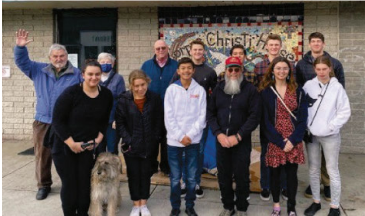
The Youth Group delivered Giving Tree packages to Corpus Christi House.