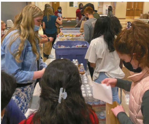
December's Homeless Lunches were packed by our Confirmation Students.