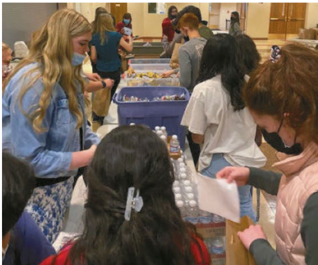
December's Homeless Lunches were packed by our Confirmation Students.