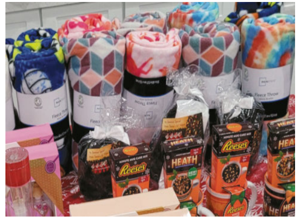
Photos from the Holiday Extravaganza held by the staff of Project Access for their clients.