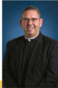
Mass will be celebrated in English

University Catholic Center 2010 University Ave, Austin, TX 78705