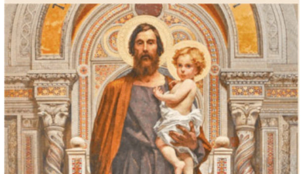
Saint Joseph, Protector of the Holy Family, pray for us!