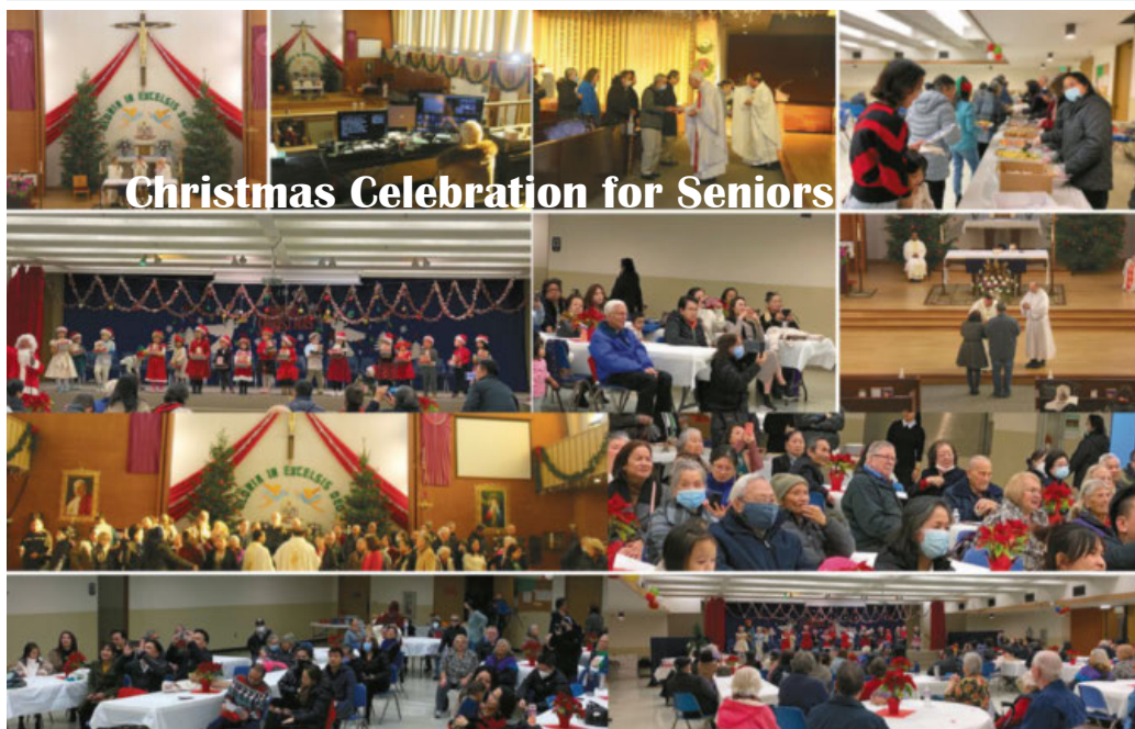
Christmas Celebration for Seniors

It was a wonderful day to celebrate Christmas with our senior group. The Mass was reverent and the party was so much fun. We thank all the parishioners who helped with this program and came to enjoy Christmas Spirit with us. May you have a joyful Christmas and a happy New Year