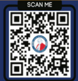
Saint Rita Station