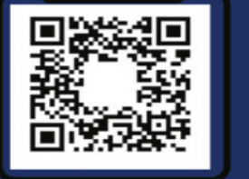
South Tacoma Chapel