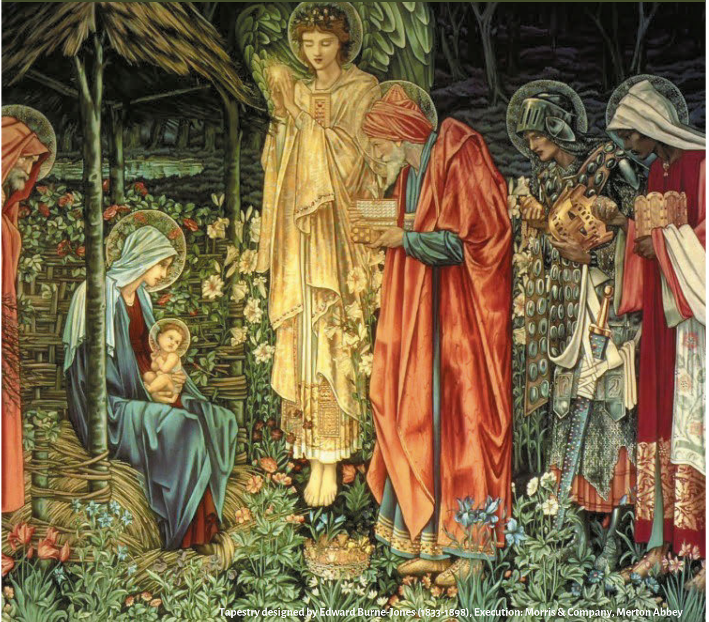
Tapestry designed by Edward Burne-Jones (1833-1898), Execution: Morris & Company, Merton Abbey