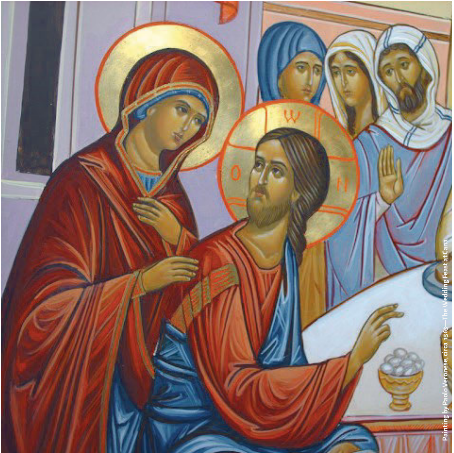
Painting by Paolo Veronese, circa 1563—The Wedding Feast at Cana

209 West 11th Street, Port Angeles, WA 98362 | (360) 452-2351 | www.clallamcatholic.org | qasj@olypen.com