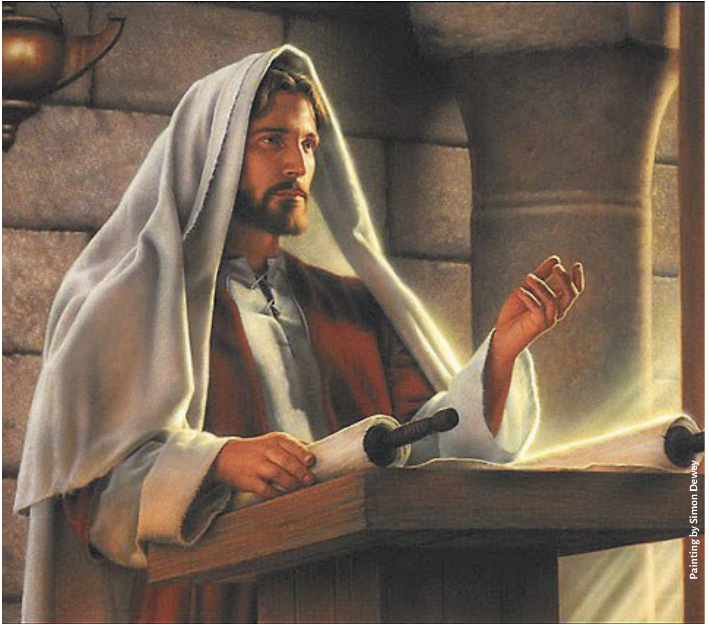
Painting by Simon Dewey

209 West 11th Street, Port Angeles, WA 98362 | (360) 452-2351 | www.clallamcatholic.org | qasj@olypen.com