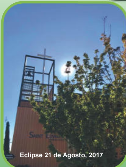
Eclipse 21 de Agosto, 2017