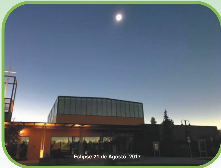
Eclipse 21 de Agosto, 2017