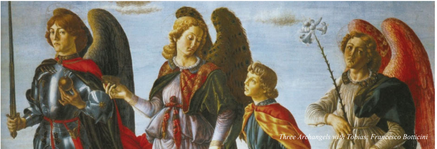
Three Archangels with Tobias: Francesco Botticini