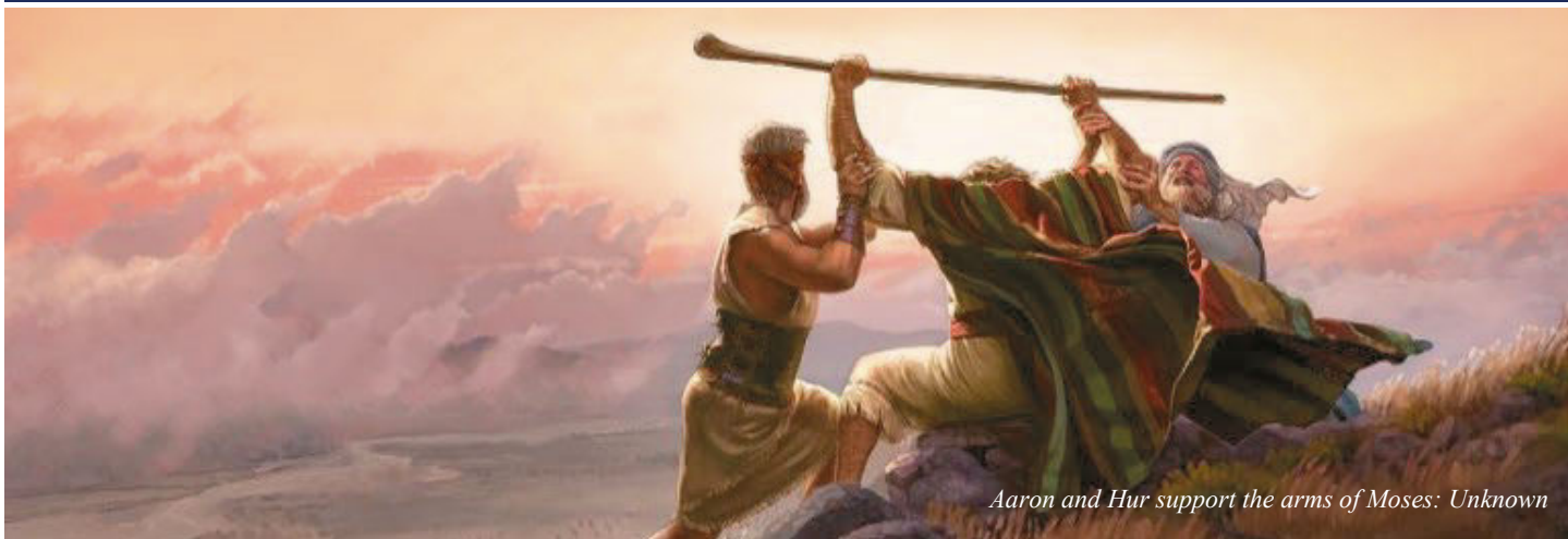
Aaron and Hur support the arms of Moses: Unknown