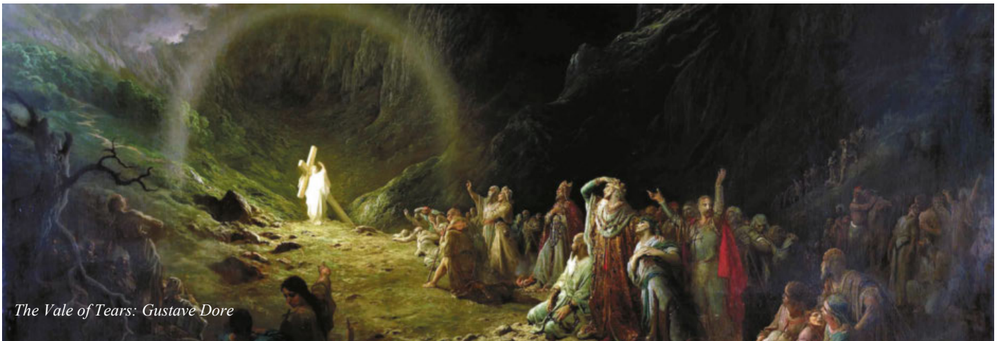
The Vale of Tears: Gustave Dore