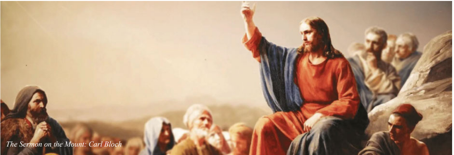
The Sermon on the Mount: Carl Bloch