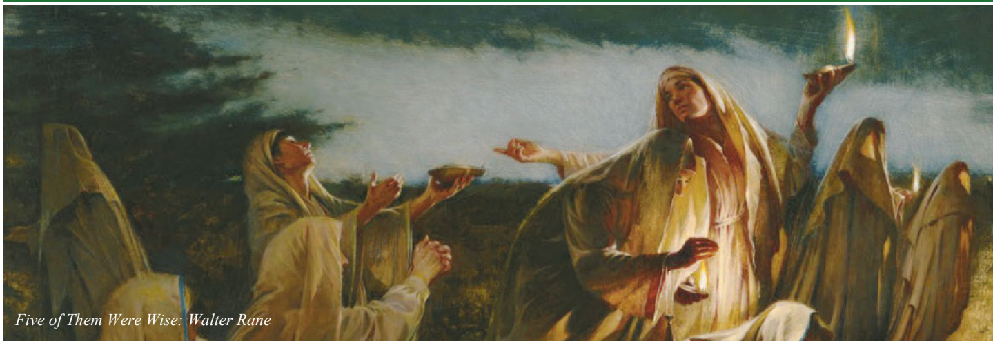
Five of Them Were Wise: Walter Rane