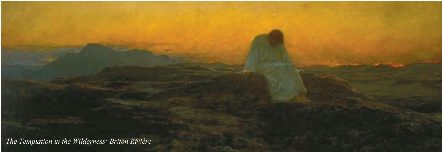
The Temptation in the Wilderness: Briton Rivière