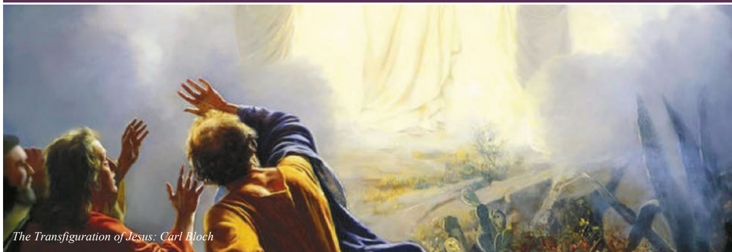
The Transfiguration of Jesus: Carl Bloch