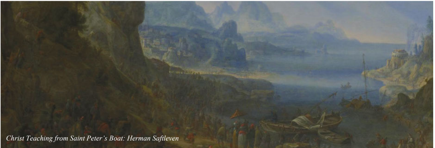
Christ Teaching from Saint Peter's Boat: Herman Saftleven