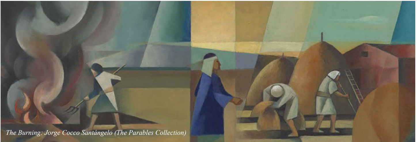
The Burning: Jorge Cocco Santángelo (The Parables Collection)