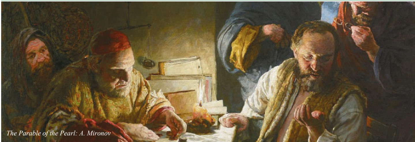
The Parable of the Pearl: A. Mironov