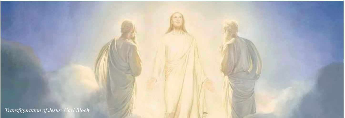
Transfiguration of Jesus: Carl Bloch