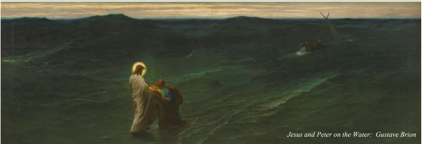
Jesus and Peter on the Water: Gustave Brion