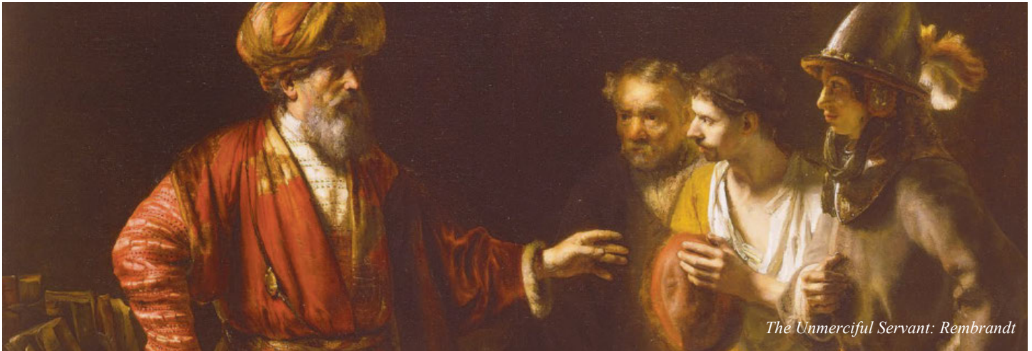
The Unmerciful Servant: Rembrandt