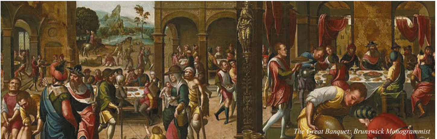
The Great Banquet; Brunswick Monogrammist