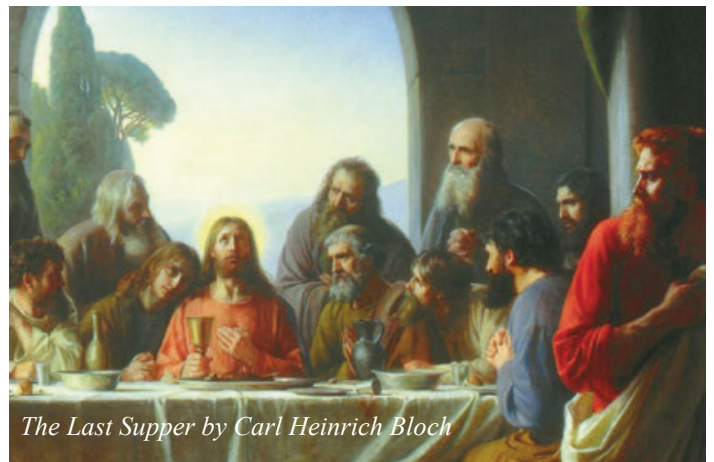
The Last Supper by Carl Heinrich Bloch

At OLSOS, we see the vital importance of instruction on sacred art as it is often integrated into a history, science, literature, or religion lesson.