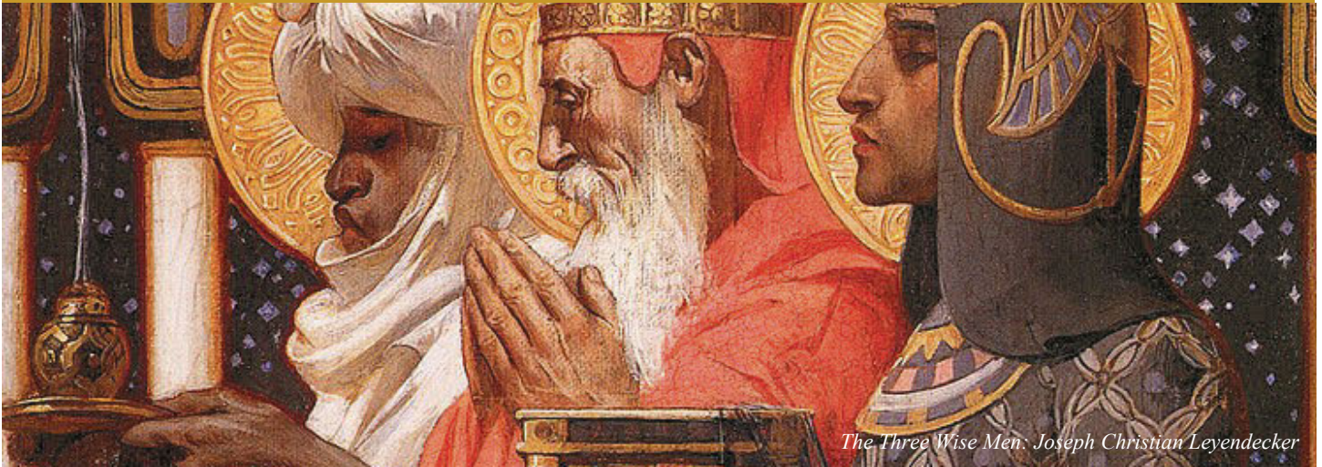
The Three Wise Men: Joseph Christian Leyendecker