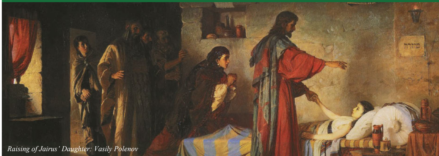
Raising of Jairus' Daughter: Vasily Polenov