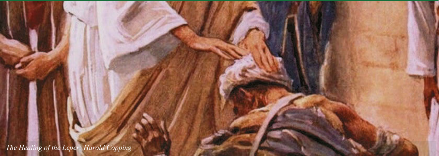
The Healing of the Leper: Harold Copping