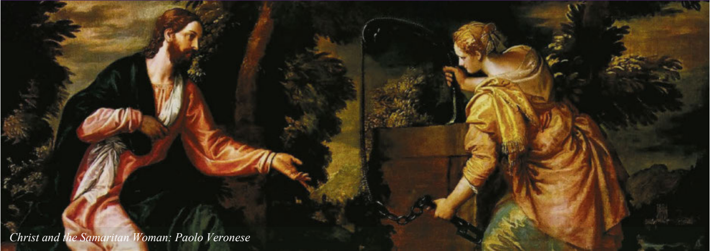
Christ and the Samaritan Woman: Paolo Veronese