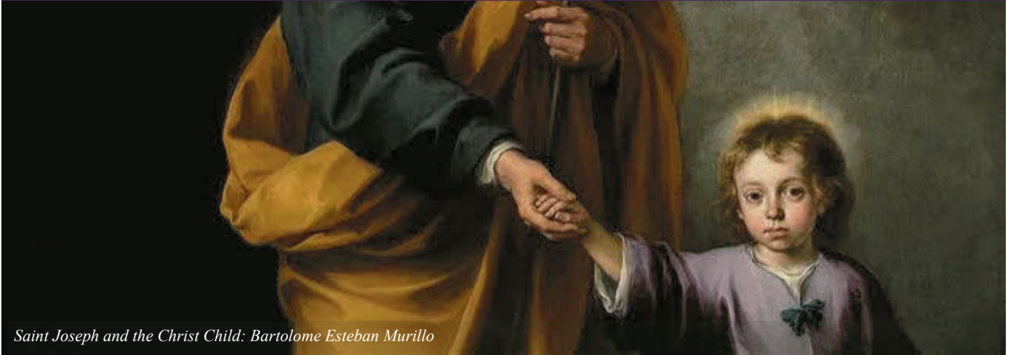
Saint Joseph and the Christ Child: Bartolome Esteban Murillo