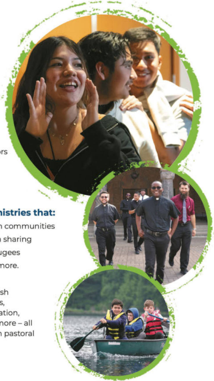
PICTURED FROM TOP: Catholic Youth Convention, Seminarians, CYO Camp

Your ACA donation directly supports your parish with centralized services like human resources, financial services, liturgy guidance, faith formation, communications, building construction and more – all to ensure your parish can spend more time on pastoral care and less time on administration.