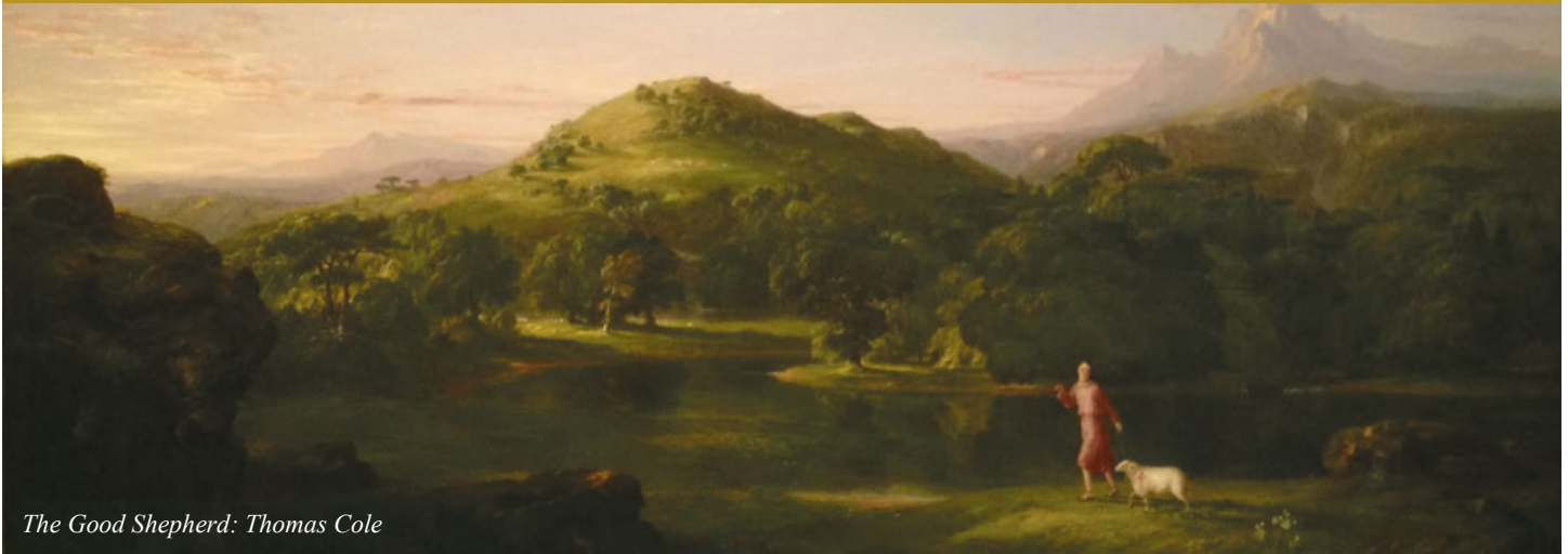
The Good Shepherd: Thomas Cole