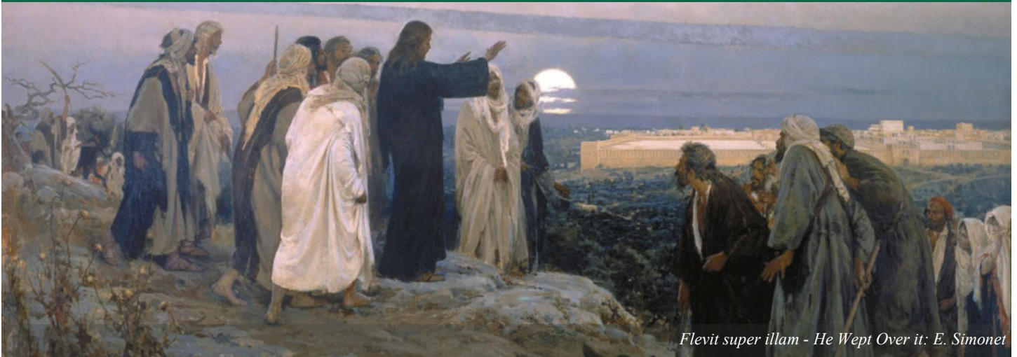
Flevit super illam - He Wept Over it: E. Simonet