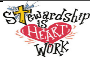
Plate Collection for Jan. 3 — Jan. 9th, 2022

Envelope, Loose Checks & Cash $ 12,811.02 Special Holy Days $ 430.00