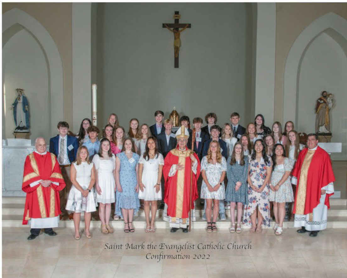
Saint Mark the Evangelist Catholic Church Confirmation 2022