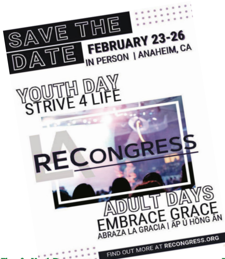
Flyer for Youth Day