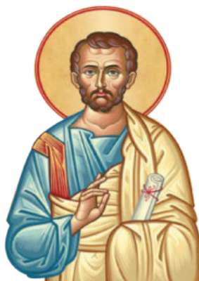
ST. BARNABAS FEAST DAY: JUNE 11