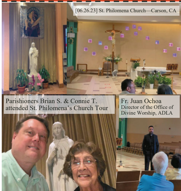
[06.26.23] St. Philomena Church—Carson, CA

Archdiocese of Los Angeles: www.LACatholics.org