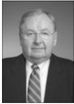
Leo M. Bean