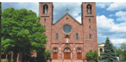
ST. MARY'S CHURCH 95 North Main Street Canandaigua, NY 14424