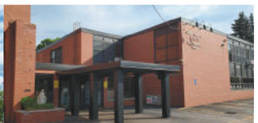
ST. MARY'S SCHOOL 16 Gibson Street Canandaigua, NY 14424