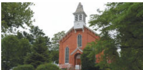
ST. BRIDGET'S CHURCH 15 Church Street Bloomfield, NY 14469

Now, more than ever, our children need Catholic education. Now, more than ever, our children need St. Mary's School. Now, more than ever, we need St. Mary's School.