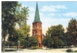
St. Francis deSales