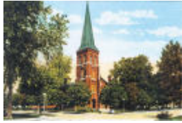
St. Francis deSales

San Francisco de Sales 130 Exchange St., Geneva, New York 14456