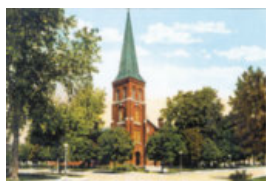
St. Francis deSales