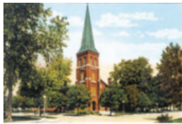
St. Francis deSales