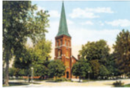
St. Francis deSales