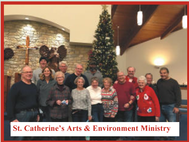
St. Catherine's Arts & Environment Ministry

Thank You to all who have already made their pledge. Christmas Blessings to all and Peace in the New Year!