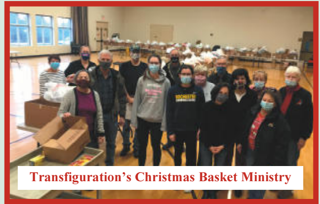
Transfiguration's Christmas Basket Ministry

Consult not your fears, but your hopes and your dreams. Think not about your frustrations, but about your unfulfilled potential. Concern not yourself with what you tried and failed in, but what it is still possible to do. Now is the time to put aside past and present setbacks and failures and look with confidence to the new day called tomorrow.