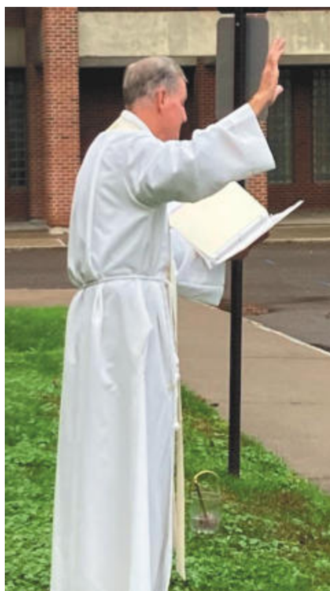
Receiving their blessing on the Feast of St. Francis.